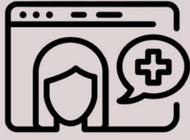
TELETHERAPY & TELE-INTERVENTION