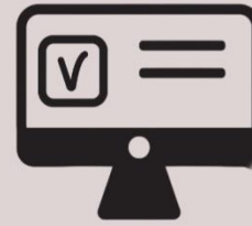
ONLINE OPTIONS FOR DATA TRACKING